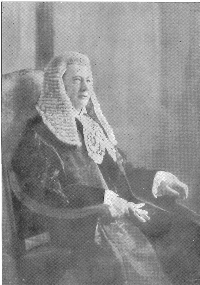
R.W. Bro. Baron Swinfen Eady P.G.W - Founder Master The Master of the Rolls 1918-19